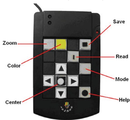
Eye-Pal SOLO LV keypad

Eye-Pal Solo LV can switch from a female to a male voice, recognize English or Spanish text (more languages coming soon), describe page layout, display in a Continuous Line scroll or in a Column scroll mode. These valuable features provide added flexibility for easy access to a wide variety of print, handwriting, photographs, bottles, cans, and more.